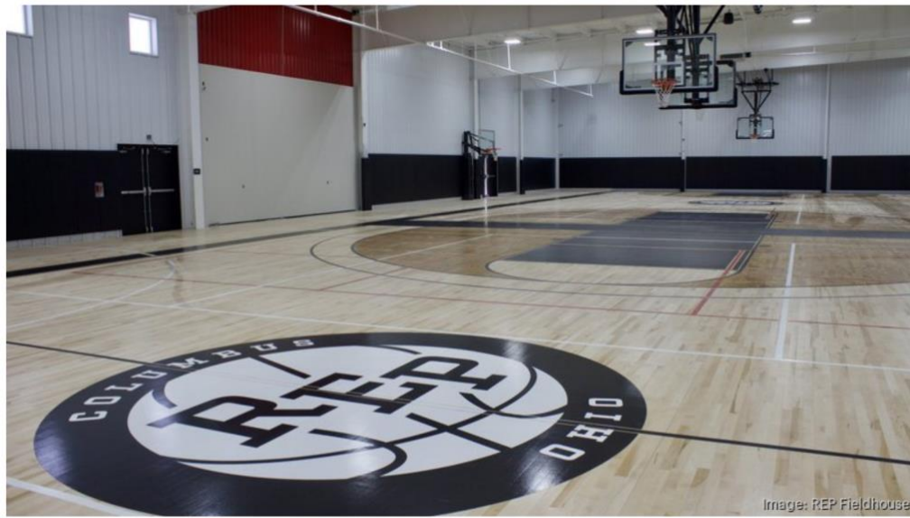
Image: REP Fieldhouse