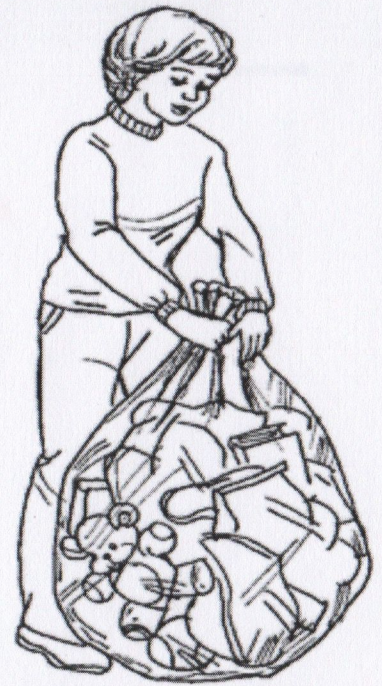
Picture 1 - Put things that can't be washed in a plastic bag and seal for 14 days. Keep plastic bags away from children.

If you have any questions, please call _____ or your local health department.