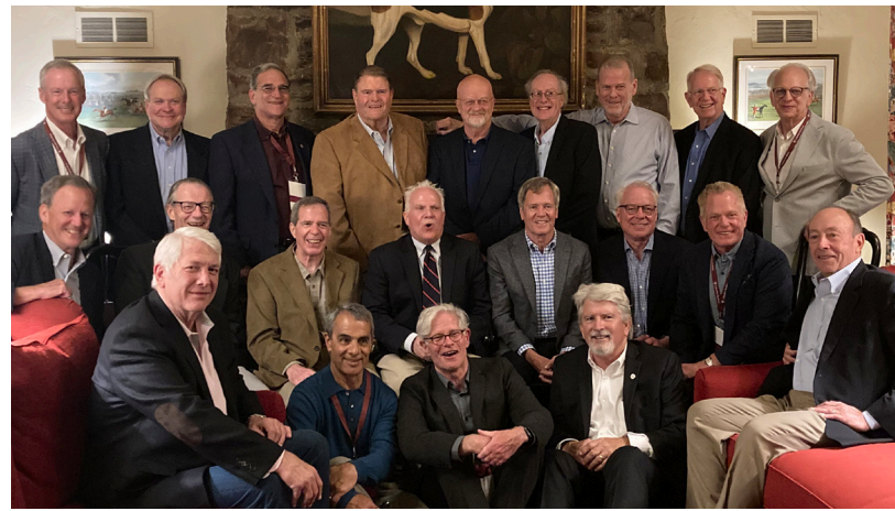
Class of 1971 50 th reunion gathering in the fall of 2022

Read more about this special story in the next issue of the school's magazine later this year.